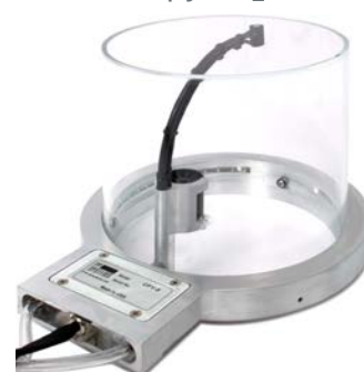
CPY-5 Canopy Assimilation Chamber Includes sensors for measurement of air temperature and PAR