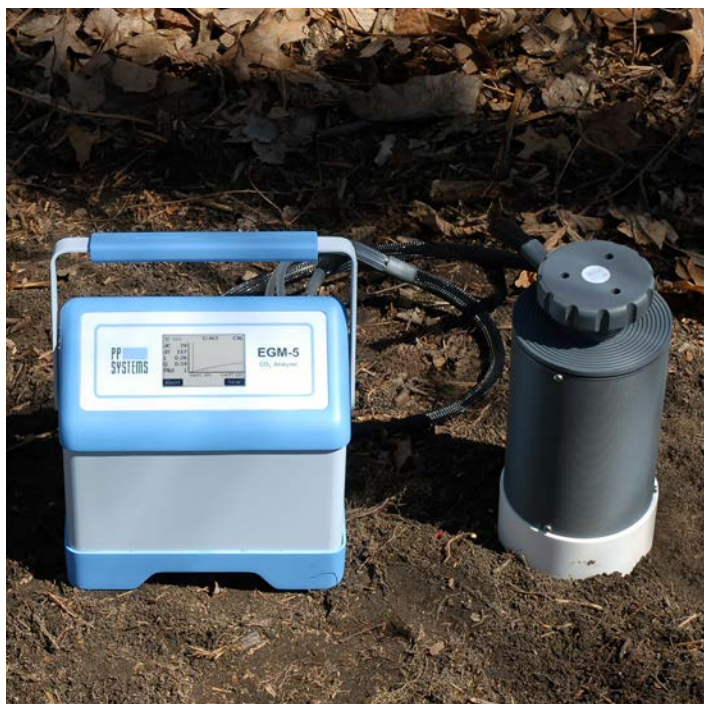
Optional collars are available for use with the SRC-2 (shown) & CPY-5 chambers.

As versatile as it is portable, the popular EGM-5 Portable CO 2 Gas Analyzer is the instrument of choice for the survey measurement of soil CO 2 efflux when your application demands portability along with a high level of accuracy and control at an affordable price. Quick set up and intuitive software provides a highly user-friendly experience for monitoring, logging and recording environmental sensor data in real time.