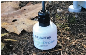
Soil Moisture & Soil Temperature