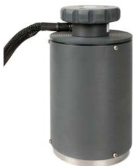
SRC-2 Soil Respiration Chamber With built-in temperature sensor